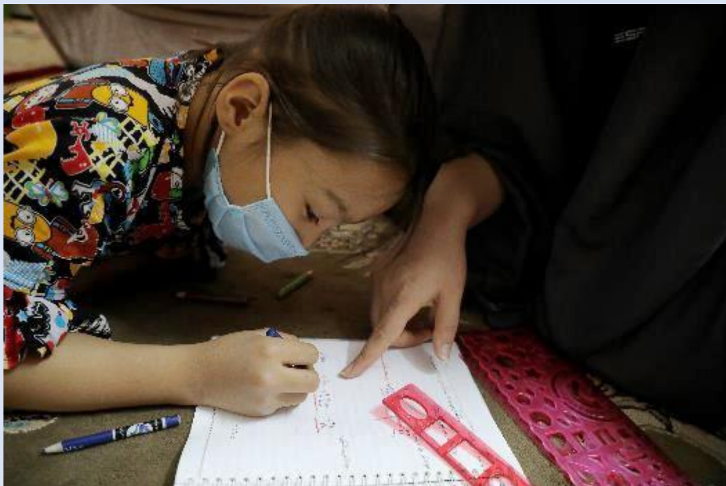
Iran. Afghan Refugees during COVID19 times

In 121 out of 123 countries, persons of concern are already receiving vaccinations.