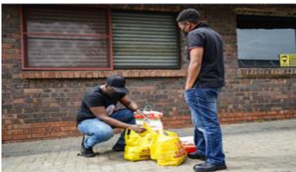
The Fruit Basket staff distributing food and essential household and hygiene items to LGBTQI+ refugees in Johannesburg, South Africa.