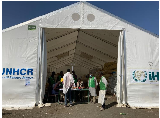
NFI distribution in Tunaydbah camp

In Hamdayet , IMC have deployed Community Health Volunteers (CHV) for Risk Communication and Community Empowerment (RCCE) and are distributing at the same time hygiene kits and are implementing hand hygiene stations. UNHCR is expanding CHV through implementing partner SRCS.