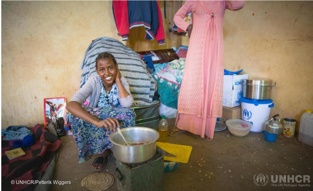
An Eritrean refugee cooks for her family at Mai Aini refugee camps in northern Ethiopia.