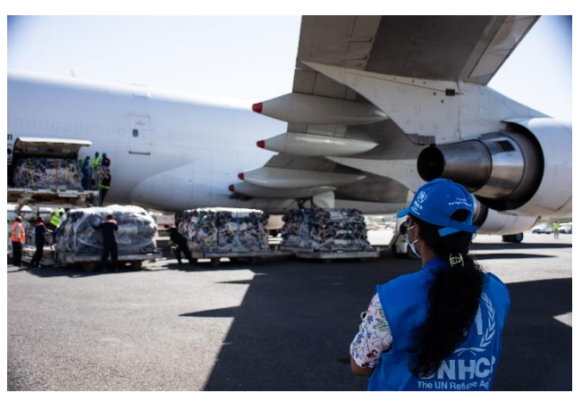
Airlifted humanitarian assistance arrives to Sudan to support with the influx of Ethiopian refugees.

The initial assessment by DRC Site Planner and UNHCR for construction of multi-purpose structures as part of flood response has been completed. Recommendations on the distribution of structures across sites is based on population density per catchment areas, distances, flood