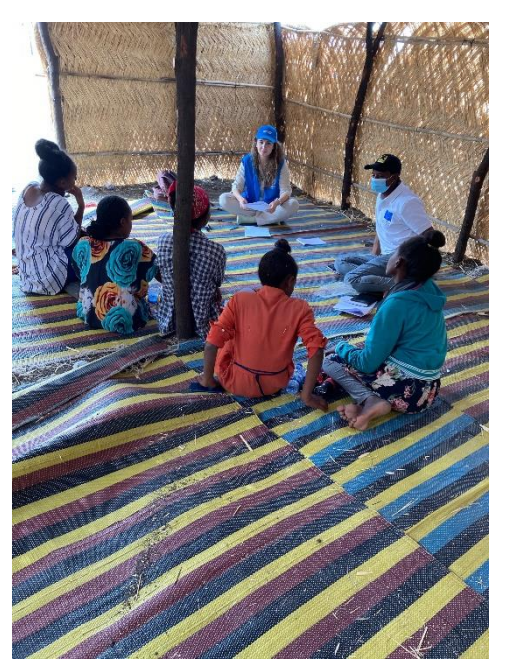
UNHCR protection teams hold focus group discussions with Ethiopian girl refugees in Tunaydbah settlement in East Sudan.

A second Women's' Centre has been opened by Alight in Tunaydbah. Women held informal discussion on the situation in the camp and those with specific needs were identified and referred to services provided in the settlement.