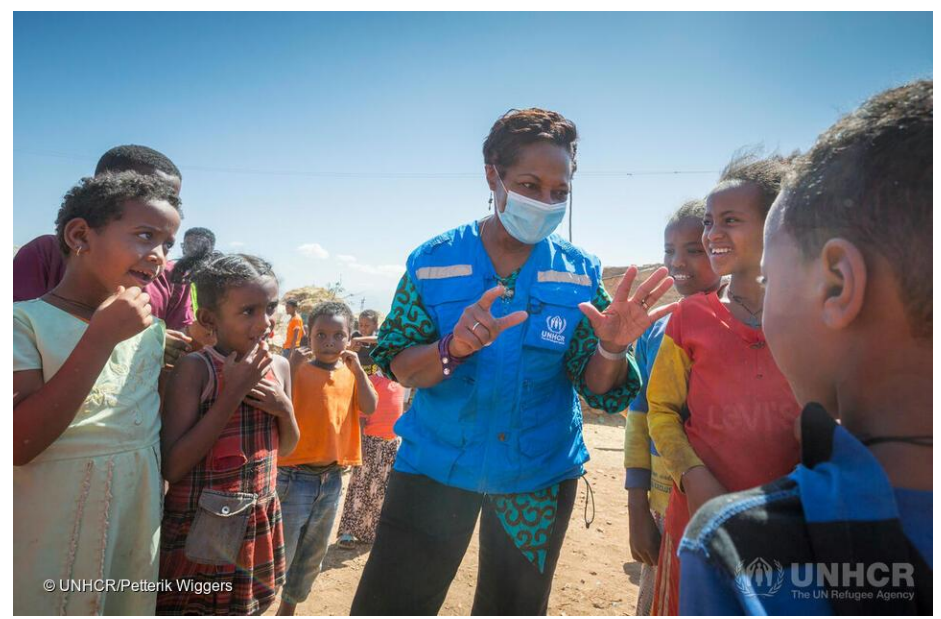
UNHCR Ethiopia Representative talks to Eritrean refugee children in Mai-Aini camp in the Tigray region.