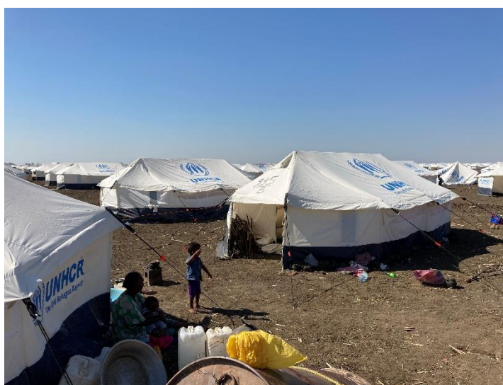
UNHCR family tents set up at Tunaydbah settlement

In Um Rakuba , 567 emergency latrines have been constructed, bringing the ratio to 1:36. Partners have started the construction of permanent shared household latrines. Water production ranges between 11.5 l/p/d and 15.8 l/p/d due to operational issues with the borehole which uses state electricity which is unreliable. New bladders have been installed for households who are being relocated within the camp as part of flood mitigation.