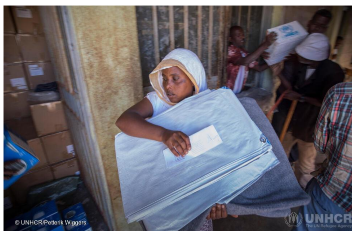
Eritrean refugees collect humanitarian aid at Mai Aini camp in the Tigray region.

IDPs On 2 March, IOM released a Displacement Tracking Matrix (DTM) report based on assessments carried out in December and January. 131,590 IDPs (30,383 households) were identified to be displaced across 39 sites in Tigray, Amhara and Afar regions. 91,046 IDPs (20,530 households) were found in Tigray region, 6,453 IDPs (3,533 households) in Amhara region and 34,091 IDPs (6,320 households) in Afar region. These displacement figures do not reflect the total displacement in the Tigray situation, but the number of IDPs identified in the 39 sites that were accessible.