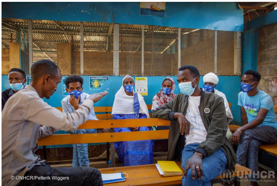
Eritrean refugees wait for a humanitarian aid distribution at Mai Aini camp in the Tigray region.