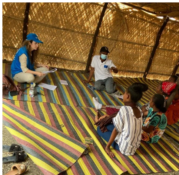
UNHCR holds focus group discussions with women and girls in Um Rakuba camp.

UNHCR leads the Gender-Based Violence (GBV) Sub Working Group (SWG) coordinating the GBV multi-sectoral response in Gedaref State with UNFPA. The SWG was established at the onset of the emergency and members include key GBV service providers. GBV Referral Pathways have been developed and continue to be updated. They are translated for wider community dissemination. Key health services are available in all locations, including clinical management of rape (CMR). Case management services are established in both Um Rakuba camp and Tunaydbah settlement.