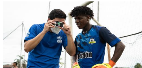
In alliance with NGO Goal Click, a photo exhibition was held in Quibdó as an activity for social inclusion through football.

For more information on UNHCR response, please refer to the UNHCR Response Dashboard .