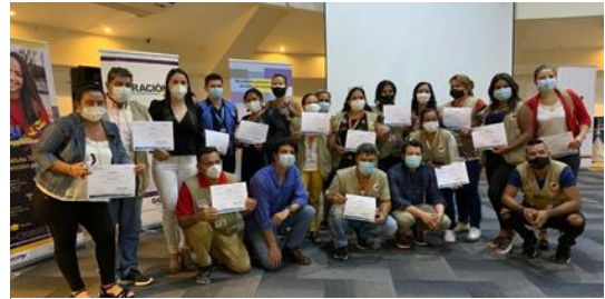
In cooperation with Colombia's migration authorities and UNHCR, the National Federation of Ombudspersons (Fenalper) provided training on the TPS to representatives of Norte de Santander