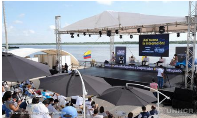
Virtual World Refugee Day festivities took place in Barranquilla, Colombia. The event was attended by the UN High Commissioner, Filippo Grandi.