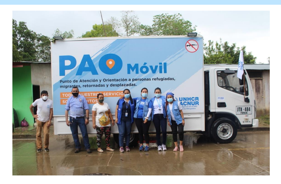
An Information and Orientation Mobile Unit (PAO) in Arauca providing services to Venezuelan refugees and migrants, Colombian IDPs and returnees in the rural areas of Arauquita