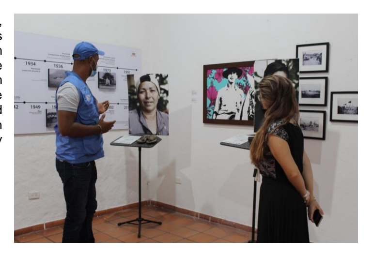
'Footprints and Face of People in Transit' exhibition at the Museum House Ocho de Julio in Yopal, Casanare.