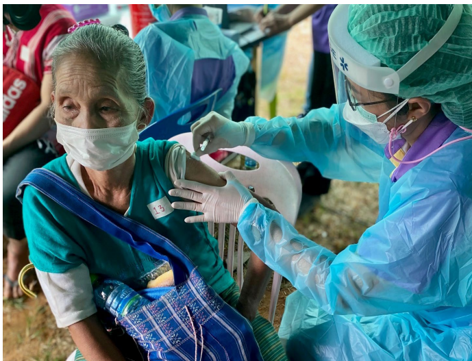
An elderly refugee receives her first dose of COVID vaccination during Thai Red Cross campaign on 25 October 2021 in Tham Hin Camp, Thailand