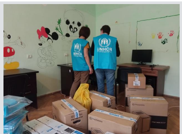
UNHCR Armenia staff delivering assistance.

and community support initiatives are launched through Armenia. Two municipalities and five community-based organizations were provided with technical assistance.