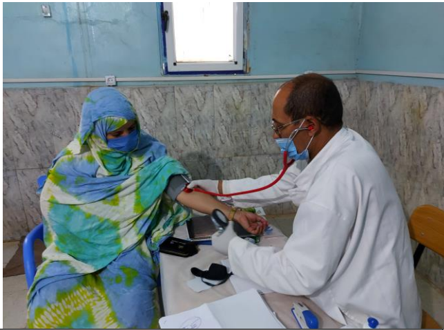
A refugee is receiving treatment from a trained refugee doctor in the Sahrawi camps.

education and shelter support to refugees and asylum-seekers. UNHCR is working with humanitarian actors to alleviate the impact of COVID-19 for the refugees and asylum-seekers in the camps and urban areas.