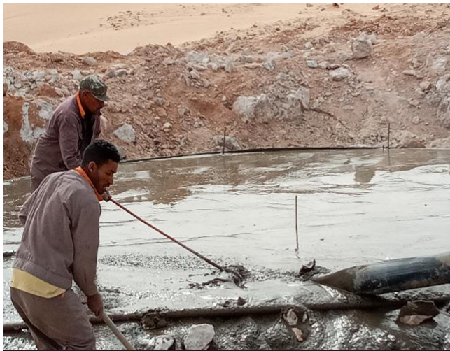
Construction of a water reservoir in Awserd camp.

Due to the COVID-19 pandemic, UNHCR has adapted its activities while continuing to provide lifesaving assistance.