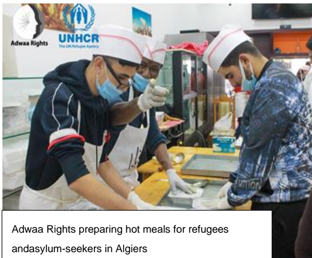
Adwaa Rights preparing hot meals for refugees and asylum-seekers in Algiers

its activities to support refugees and asylum-seekers infected by the virus and impacted by the economic activities while continuing to provide lifesaving assistance.