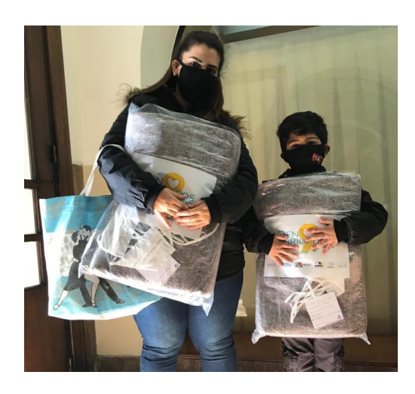
Venezuelan family receiving winter kits amidst the COVID-19 pandemic in Buenos Aires