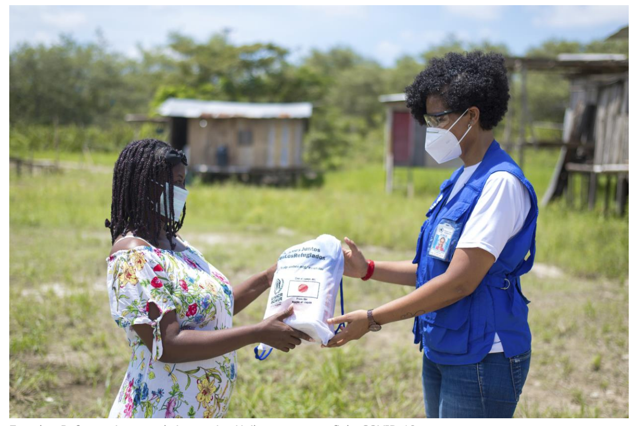
Ecuador. Refugees in coastal city receive Unilever soaps to fight COVID-19