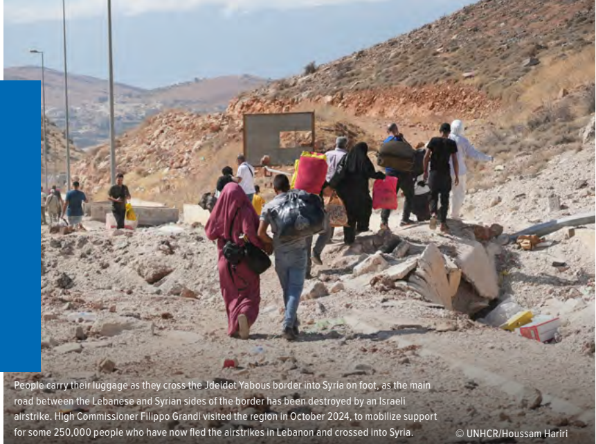
People carry their luggage as they cross the Jdeidet Yabous border into Syria on foot, as the main road between the Lebanese and Syrian sides of the border has been destroyed by an Israeli airstrike. High Commissioner Filippo Grandi visited the region in October 2024, to mobilize support for some 250,000 people who have now fled the airstrikes in Lebanon and crossed into Syria.