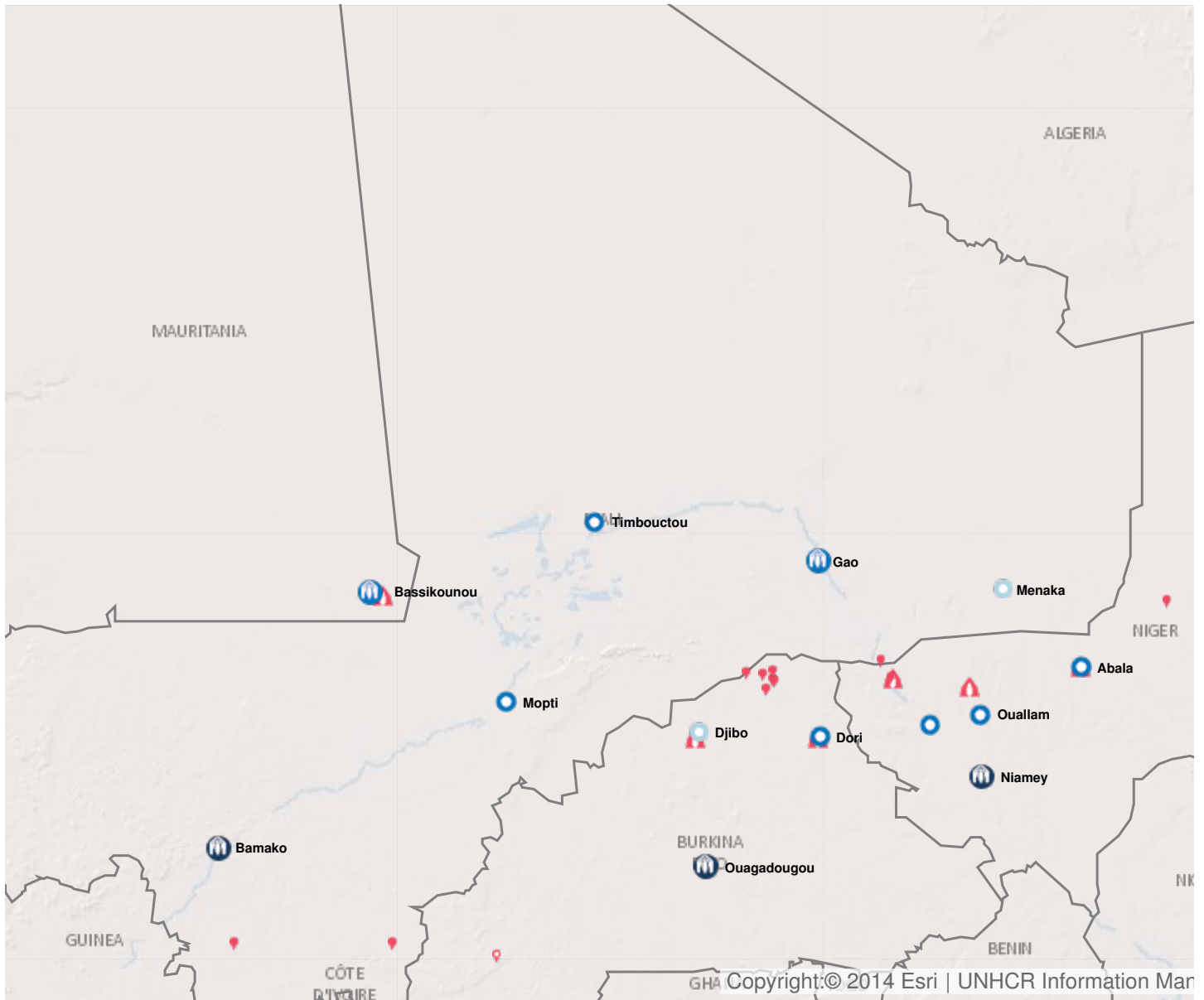
Latest update of camps and office locations 21 Nov 2016.