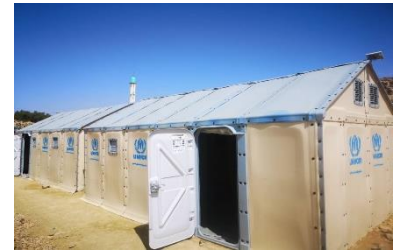
UNHCR installed two RHUs for use as temporary classrooms for girls attending grades 1-3, who otherwise would have missed school due to distance.

UNHCR Field Office (FO) Sana'a visited two IDP sites in Houth district, Amran governorate, which currently hosts some 171 IDP families, to monitor the impact of services delivered and to identify critical needs and gaps for enhancing operational response. With gaps identified in health and education, a mobile health team and referral system was requested, while a refugee housing unit (RHU) was installed as a classroom for some 15 primary school-aged girls unable to attend school due to the long travelling distances.