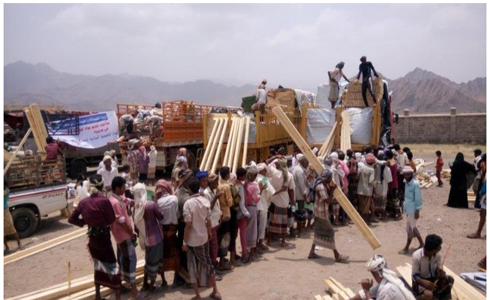
Emergency shelter kits and core relief items reach displaced families in need, in Mokha, Taizz Governorate.

Hostilities continue to mar efforts to broker peace, disproportionately affecting Yemen's displaced population. Civilian casualties and forced displacement have resulted in loss of life, family separation and the breakdown of community structures. During the past two months, the number of those newly displaced continues to rise, due to an escalation in conflict in Taizz and Sa'ada Governorates, which has precluded families' safe return, leaving them caught in an exhaustive cycle of multiple displacement in frontline areas. UNHCR continues efforts to reach newly displaced with emergency assistance where access permits.