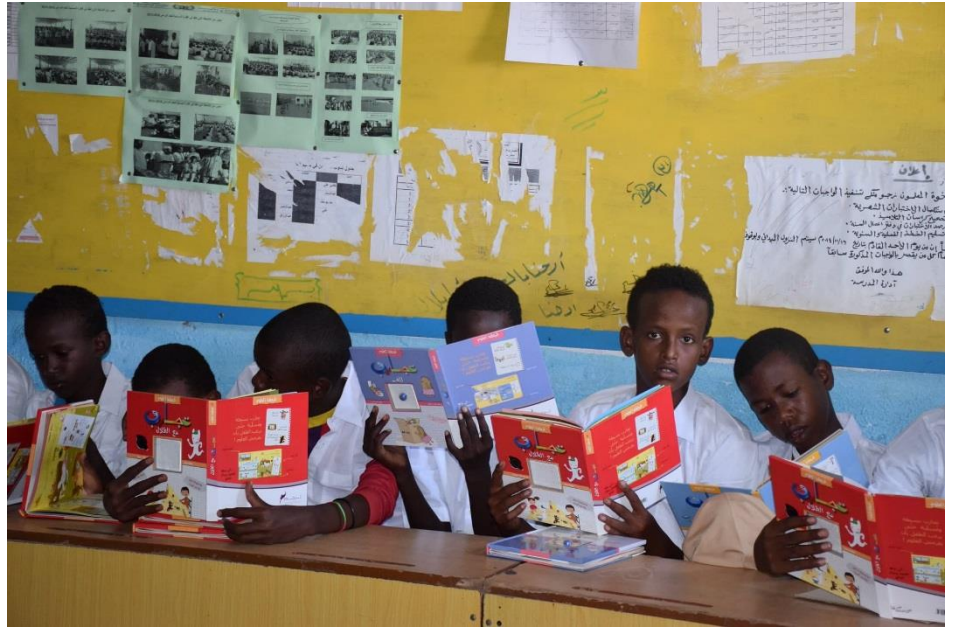
MBM Knowledge Foundation gifted 2,342 books to three primary schools in Lahj and Aden governorates supporting 4,500 Yemeni and refugee children.

At the same time, reports continue to reach UNHCR of new displacement as fighting in frontline areas persists. Hostilities in the deeply contested Taizz Governorate have forced some 100 families to flee their homes in recent days. The families are currently sheltering in appalling conditions in the Ras Al-Arah district in Lahj Governorate, with early reports suggesting that more than half of families are sleeping in open air, exposed to the elements. Concern is growing for the newly displaced, with an assessment expected to take place as soon as possible to minimise risks and to provide families with much needed assistance.