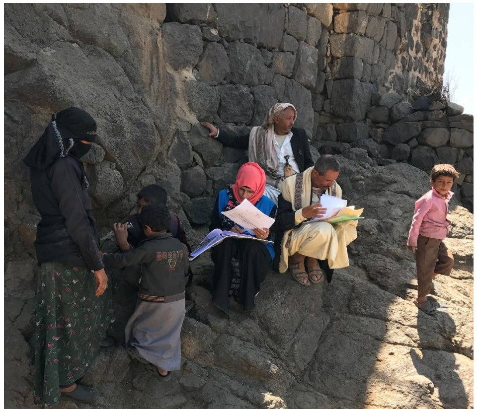
UNHCR field staff carry out missions to some of the most isolated areas in Yemen, including in the mountainous areas of Dhamar Governorate.

UNHCR has also witnessed an increase in needs among the displaced population, as prolonged conflict impacts on families' safety and security, in particular those forced to flee. UNHCR has received reports of new displacement and need for urgent aid for an estimated 1,000 families who have fled ongoing hostilities and are now seeking shelter in Zabid, Bayt Alfaqih and Al Jarrahi districts in Hudaydah. Furthermore, the number of IDPs in Turban district areas in Lahj Governorate continues to increase, with some 50 families arriving to the area since September after fleeing hostilities in Taizz. Rapid needs assessments are underway to better understand the needs of both communities.