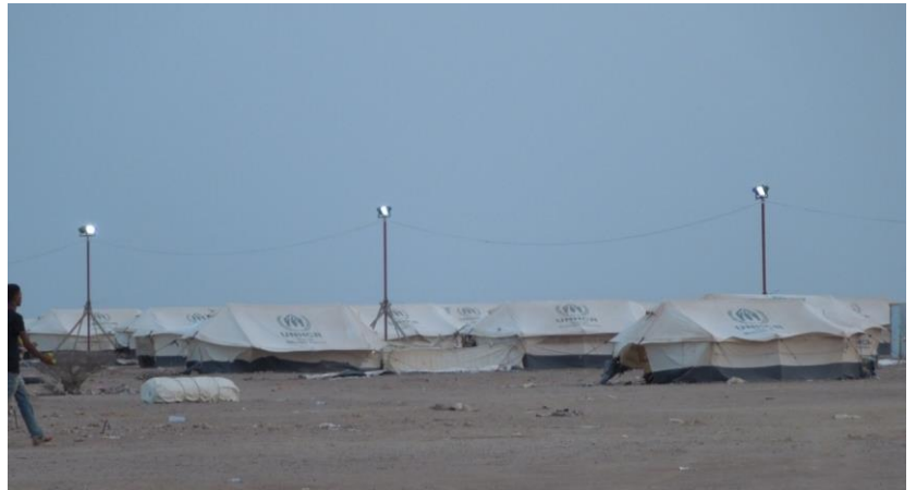
Markazi Refugee Camp, Djibouti – Thanks to the Arrahma Association, refugees enjoy bright evenings.