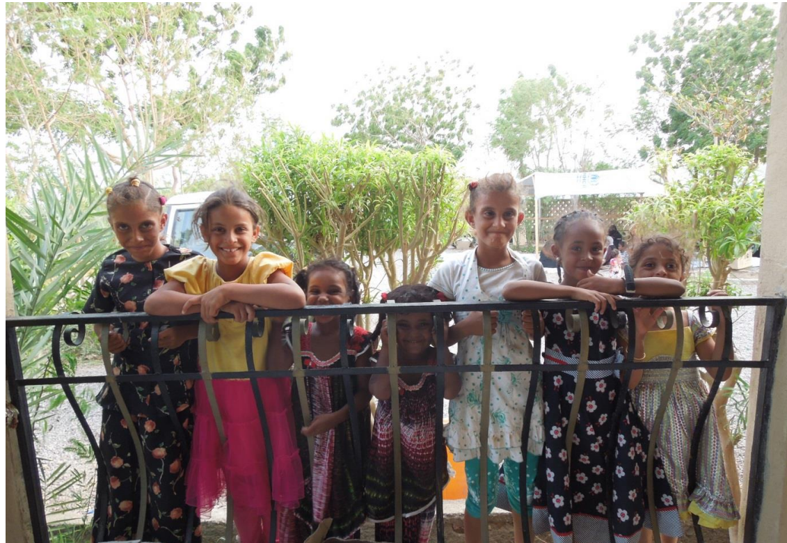
Refugee children in UNHCR's compound, where they were given temporary shelter when violent sandstorms damaged Markazi refugee camp in Obock, Djibouti. ©UNHCR/S.Malaguti, 18 July 2015.