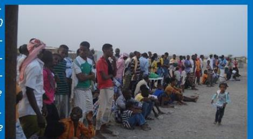
Bystanders watching the last game of the Champions Football Club

During the Holy Month of Ramadan, UNHCR's partner InterSos spear-headed several activities for the refugee community in Kharaz refugee camp in Yemen. One of the most popular activities was the formation of a Champions Football Club. Refugees of all ages came together for a match, cherishing the opportunity to have fun and forget the stress they face with the insecurity, scarce basic services and lack of livelihood opportunities. UNHCR and partners have had little access to the refugee camp and providing lifesaving aid to the camp has been extremely difficult.