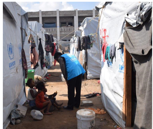
UNHCR transitional shelters in Aden in December 2018, housing families displaced from fighting in Al Hudaydah.

UNHCR continues to identify, upgrade and repair sub-standard shelters rented by refugees. Rented shelters are being improved to benefit refugee tenants and Yemeni host communities as part of the Basateen Roadmap project to improve living conditions and foster social cohesion. Basateen is a neighbourhood on the outskirts of Aden, where a large number of vulnerable refugee families are living. In 2018, UNHCR made improvements to 190 homes in Basateen that are rented by refugees, and a further 300 will be repaired or upgraded in 2019.