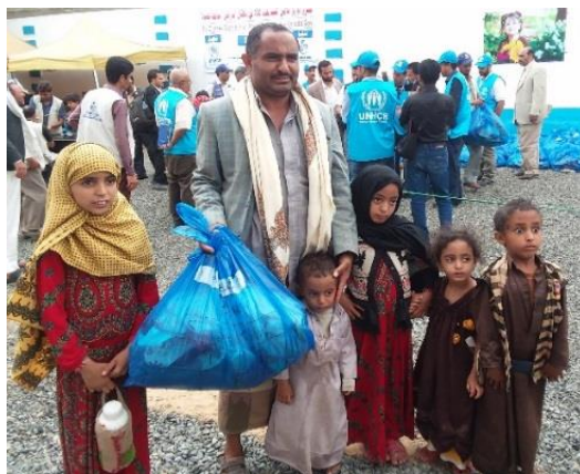
UNHCR started the distribution of clothes for Eid, targeting 450 IDP children and children from vulnerable hosting families.

On 1 August, UNHCR staff distributed Eid clothing and gifts to 450 targeted children in Sa'ada IDP community center, Sa'ada governorate. The recipients were selected from Sa'ada city and Akwan area during previous field assessment visits. An official ceremony was prepared at the IDP community centre attended by the de facto run National Authority for the Management and Coordination of Humanitarian Affairs (NAMCHA), local authority representatives, UNHCR staff, and local media.