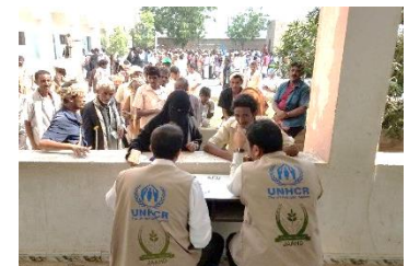
UNHCR provided 50 basic household item packages and 50 emergency shelter kits to a Shelter/NFI Cluster partner to respond to newly displaced families in Maqbanah district, Taizz governorate. The partner also provided technical support for the installation

UNHCR, through partners, has completed the distribution of 102 basic household item packages and 37 emergency shelter kits to IDPs families who mostly fled from frontline areas in Sa'ada governorate. Clashes between SLC-backed forces and the de facto authorities were reported along the Saudi-Yemen border of Sa'ada, mainly in the western districts, causing civilian deaths, casualties, displacement and loss of property. In addition, 464 IDP families received basic household items in the central district of As Safra. So far this year, some 9,000 IDP families have received basic household item packages in Sa'ada governorate.