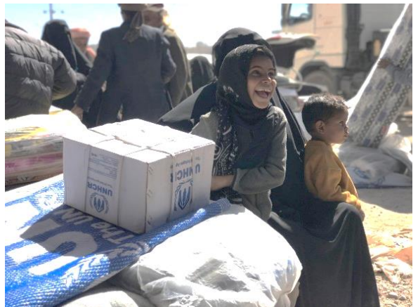
A brother and sister sit beside their core relief items at a distribution in Dhamar Governorate

On 29 January, four Eritrean children were resettled to Sweden. The four children were received by Sweden as part of UNHCR's emergency resettlement programme, which provides a durable solution to a limited number of individuals meeting specific vulnerability criteria.