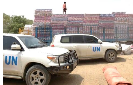
Mattresses are piled high up in trucks prior to distribution to an IDP site in Abs district, Hajjah governorate. Each IDP family member receives one mattress along with other basic household items such as solar lamps, plastic buckets and kitchen sets.

Special thanks to major donors: Belgium | Canada | European Union | Finland | France | Japan | Qatar | Saudi Arabia | Spain | Sweden | Switzerland | United Kingdom | United States of America | Country-Based Pooled Funds | Private donors (including Thani Bin Abdullah Thani Al-Thani Humanitarian Fund and Qatar Charity)