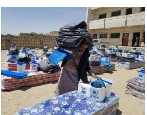
A displaced man receives basic UNHCR assistance kit Rajuzah district of Al Jawf Governorate.

Cash remains at the forefront of UNHCR's assistance in Yemen. In 2018, UNHCR assisted close to 800,000 Yemenis (and 130,000 refugees), disbursing USD 48 million. By monitoring new displacement and working with service providers, community centres and local leaders, UNHCR and its partners are able to identify and assess the needs of vulnerable households. During the reporting period, 16,753 IDP families received cash assistance to address their protection needs, including rental subsidies. Distributions were made in the northern border areas of Sa'ada and Al Jawf (3,552 families), to families at the flash point of