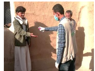
UNHCR partner staff provides hand sanitizer to a man during a door-to-door awareness raising activity on COVID-19 in Az Zaher, Al-Jawf governorate.

UNHCR continues to support the UN response for COVID-19 . During the reporting period, UNHCR distributed 16,500 items including tents, blankets, mattresses and kitchen sets to support quarantine centres in Al Dhale'e, Taizz, Sa'ada, and Al Jawf governorates. UNHCR and partners also reached 1,878 refugees and host community members through house-to-house community awareness visits in the south (Aden, Al Mukalla, Lahj), and distributed 3,000 information brochures in Sa'ada. UNHCR also partnered with the Danish Refugee Council to procure 1,500 masks for highly vulnerable IDPs, and launched an income-generating project for vulnerable displaced women to produce face masks.