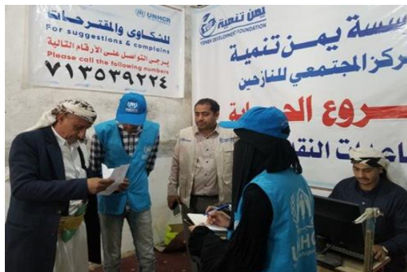
UNHCR staff monitor the distribution of multi-purpose cash assistance and rental subsidies to displaced people in Sa'ada.

In northern governorates of Yemen, through its first round of cash transfers in 2019, UNHCR is disbursing some USD 5 million, to around 29,000 IDP families – an estimated 203,000 individuals. Cash transfers are made to households in need of support to meet their protection needs or basic needs, or to help ensure that they have adequate shelter, including capacity to cope with the current winter conditions.