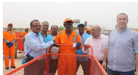
UNHCR distributes 40 sets of equipment to vulnerable refugees, IDPs, and the host community currently working in the recycling industry in Aden governorate.

On 10 July, UNHCR distributed equipment that included safety uniforms, safety gloves and shoes, eye protection, and garbage bags to 40 vulnerable refugees, IDPs, and host community members working in the recycling industry within Aden governorate. This initiative was coordinated with the ExU, with the aim of supporting beneficiaries generate their income in safety and dignity. With the provided items, the beneficiaries were able to collect enough scrap metal and plastic to sell onto wholesalers; increasing their output four-fold. This project also supports the Yemeni government in improving public hygiene. UNHCR plans to distribute equipment to an additional 300 beneficiaries this year, as part of its quick impact projects—small, rapidly implemented schemes to strengthen resilience and help create conditions for peaceful coexistence between those displaced and their hosting communities.