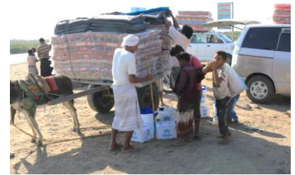
Displaced families in Hudaydah governorate receive their basic household items. Between 5-9 January, UNHCR assisted 2,195 families with emergency items.

UNHCR, through partners, completed the implementation of two Quick Impact Projects (QIPs) in Al Jawf governorate. The first is construction of a 30-student capacity classroom for girls, as requested by local authorities in Barat Al Anan district. The second is an enhancement to a water point in Al Humaydat district with solar paneling, to improve sustainability of the facility. UNHCR installed two water tanks with a total capacity of 6,000 liters in 2018, aiming to improve the health and well-being of both IDP and host communities by reducing the prevalence of water and sanitation-related disease through provision of safer water sources, while also promoting peaceful and dignified co-existence.