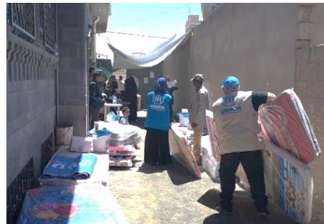
UNHCR staff help distribute mattresses, blankets, buckets and other CRIs to displaced people in Dhamar governorate.

On 8 March, 139 Somali refugees departed Aden for Berbera, Somalia. This is the twenty-ninth departure by boat for the Assisted Spontaneous Return programme (ASR) since 2017 and the third this year. An estimated 5,000 Somali refugees have departed Yemen in 2019 so far. A total of 48 Somali refugees approached the Return Help Desk in Basateen and Mukalla registration centres for counselling and voluntary return related information.