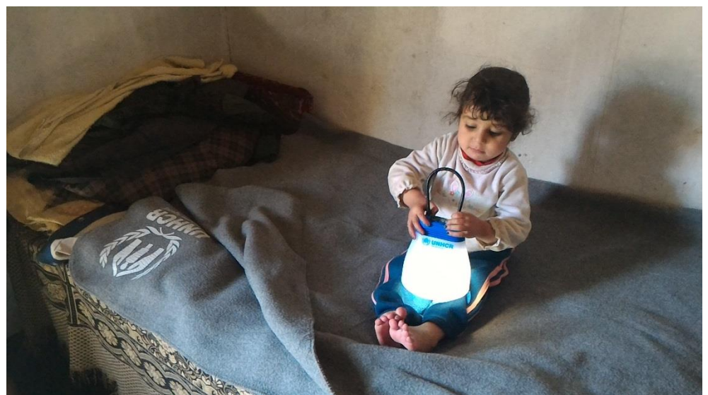
Distribution takes place for blankets and solar lanterns in Dhamar through CCCM partner Spirit Youth Foundation