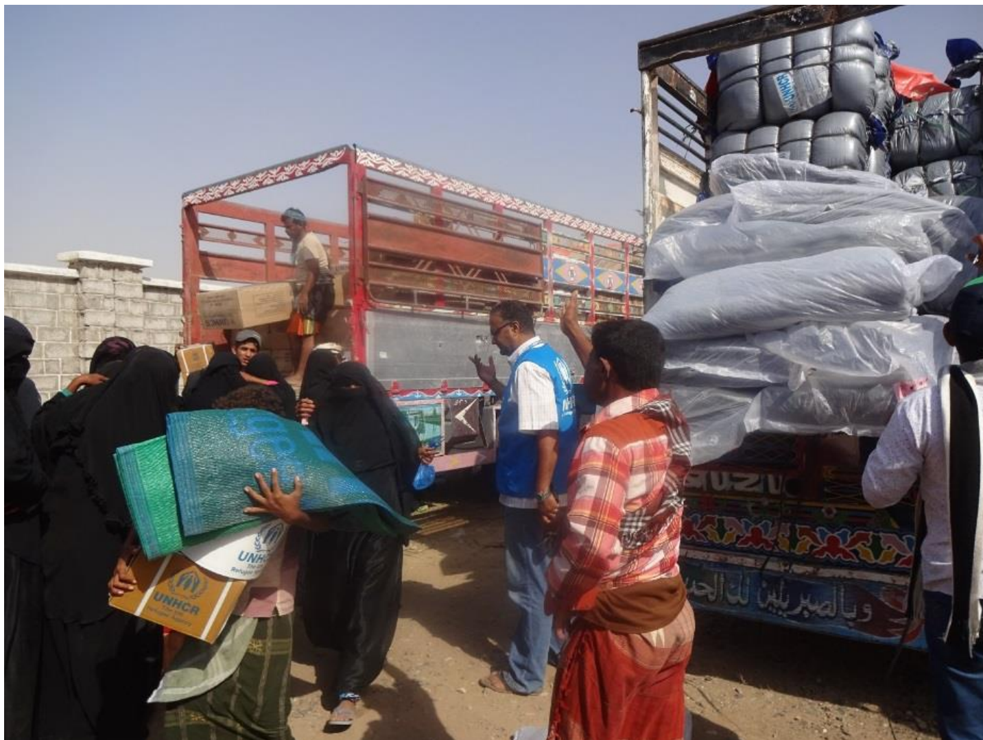
Support including shelter, NFI and winterization assistance reach in-need families across Yemen.