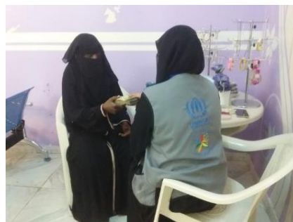
UNHCR's partner staff provides emergency cash support to an individual who visited the community centre for counselling. For emergency cases, UNHCR's partners offer a quick solution of cash-in-hand, including for emergency medical intervention, threat of eviction and other protection concerns.

The construction of 6,000 Tehama ESKs have been completed in Hajjah and Al Hudaydah governorates. The shelters are covered with woven palm-leaf sheets produced by some 800 trained internally displaced persons (IDPs) and host community families, providing them with a valuable source of income. The special and locally sourced materials help guard against warm conditions, as the area is known for its characteristically hot and humid weather.