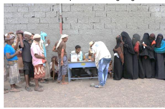
UNHCR distributed emergency basic household kits and hygiene supplies to 300 IDP families affected by the heavy rain and floods in Aden and Lahj governorates.

UNHCR partner Jeel Al-Bena received a list of 4,364 newly displaced families from the National Authority for the Management and Coordination of Humanitarian Affairs (NAMCHA). The families identified are in need of shelter