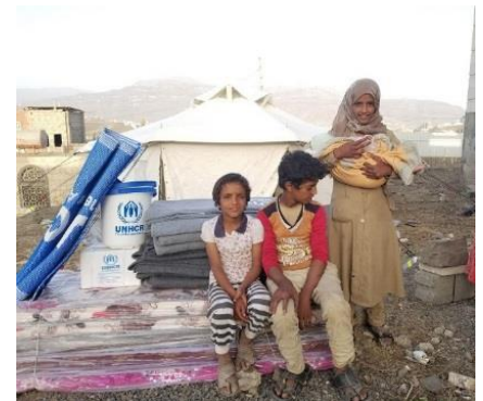
Displaced children by their tent in the southern Ibb governorate, having received UNHCR assistance.

UNHCR continues to deliver lifesaving emergency assistance in the southern governorates of Ibb and Taizz where there are several active frontlines. During the reporting period, 140 IDP families in these two governorates received CRIs and 32 IDP families received family tents. In the coming week, an additional 430 families are to receive CRIs and emergency shelter kits (ESKs) while a CRI replenishment request for 1,500 families has been sent to the country office. A total of 23,335 families have received CRIs and 5,753 families received emergency shelters in Yemen since 2019, with 10 per cent of the total having been distributed in these two governorates. Taizz and Ibb governorates alone are hosting some 14 per cent of the entire IDP and returnee population in Yemen. The highest number of CRIs/ESKs were distributed in Hudaydah governorate (some 5,000), which hosts 10 per cent of the entire IDP and 2 per cent of the returnee populations.