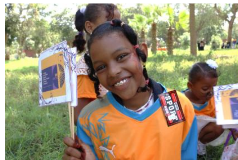
UNHCR and Intersos launched the "16 Days of Activism Against Gender-Based Violence campaign" with a round table and recreational activities for children in Aden.

UNHCR provided a one-off cash assistance to 3,324 refugee families living in Aden and Mukalla city, whose livelihoods were impacted since hostilities broke out in early August in the south. Families with valid ID cards received some USD 220 each to cover their most essential needs.