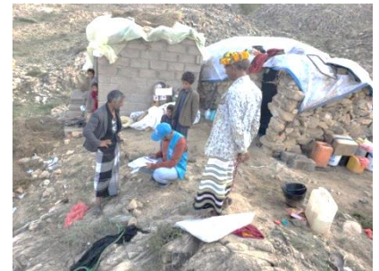
UNHCR staff conduct post distribution monitoring for delivery of non-food items in Ghamr district, Sa'ada Governorate.

Special thanks to our major donors: United States of America | Thani Bin Abdullah Bin Thani Al-Thani Humanitarian Fund | Kuwait | Country-Based Pooled Funds | Qatar Charity | United Kingdom | Japan | European Union | Finland | Sweden | Qatar | Saudi Arabia | Canada | France | Spain | Switzerland | Belgium | Miscellaneous donors in Egypt | Republic of Korea.