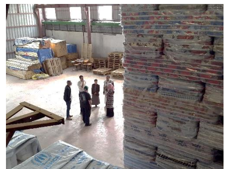
UNHCR visited partner YDF's warehouse in Sana'a before the distribution of household items. Over the coming days, a total of 503 IDPs, IDP returnee families and vulnerable host community members will receive assistance.

Special thanks to our major donors: United States of America | Thani Bin Abdullah Bin Thani Al-Thani Humanitarian Fund | Kuwait | Country-Based Pooled Funds | Qatar Charity | United Kingdom | Japan | European Union | Finland | Sweden | Qatar | Saudi Arabia | Canada | France | Spain | Switzerland | Belgium | Miscellaneous donors in Egypt | Republic of Korea.