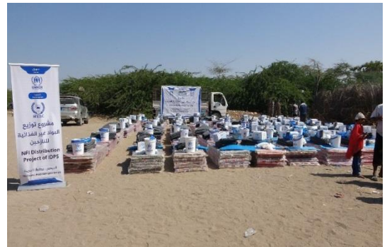
Installation of NFIs at a distribution site in Ad Durayhimi district, in Al Hudaydah governorate. UNHCR assisted 277 families (1,219 individuals) displaced by conflict with assorted items at this location.

In Al Shaab IDP community centre in Aden, UNHCR and partner NMO completed improvement works to communal kitchens. In many IDP hosting sites, the use of communal kitchens is encouraged to help prevent the risk of fire outbreaks from IDPs cooking in or near their shelters. UNHCR and partners also distributed kitchen utensils, gas cylinders, cooking stoves and traditional ovens to IDPs living on the site.