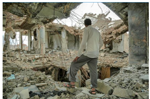
A man stands in one of his neighbourhood houses in Sana'a. The house was targeted by an airstrike on 14 January 2016, which resulted in the death of multiple civilians. As of today, the neighbourhood is still in ruins.