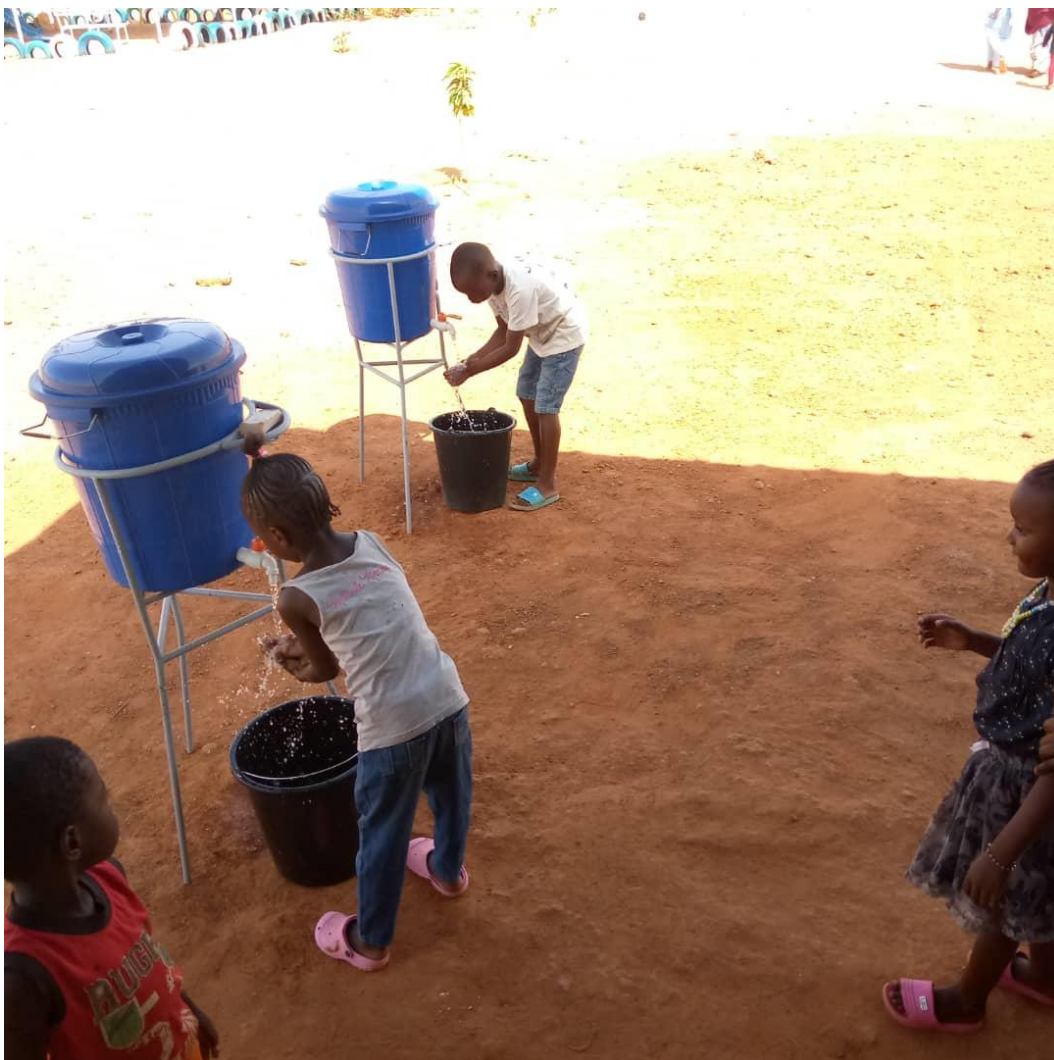
Activities organized by UNHCR and INTERSOS in Agadez to sensitize refugee children on hygiene and prevention measures