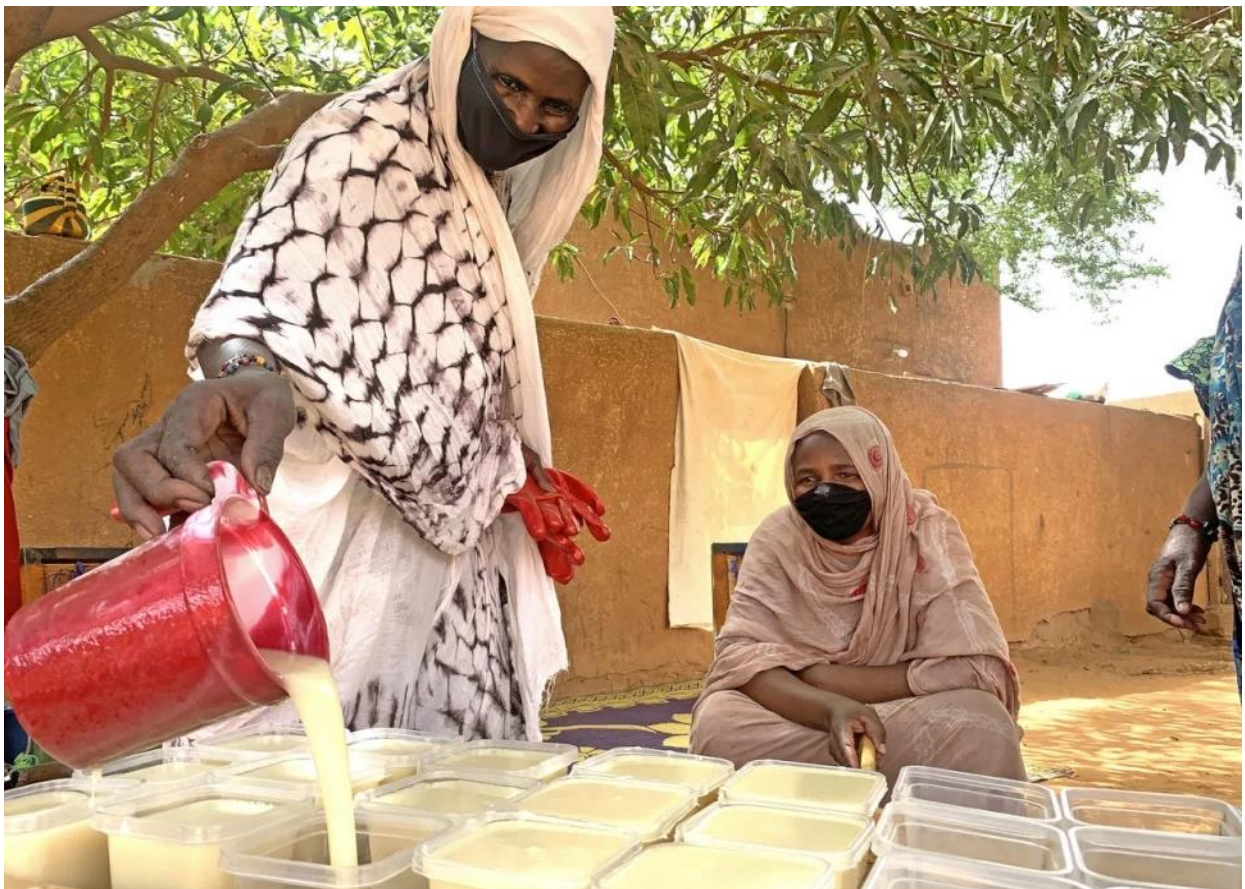
A refugee woman pours liquid soap into molds at a soap factory in Hamdallaye, Niger. The soap is distributed free of charge to other refugees and the local community.