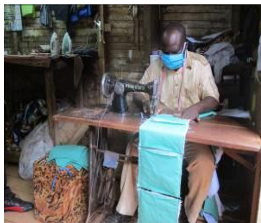
Production of masks by a refugee artisan living in Yokadouma in Eastern Cameroon near the border with CAR.