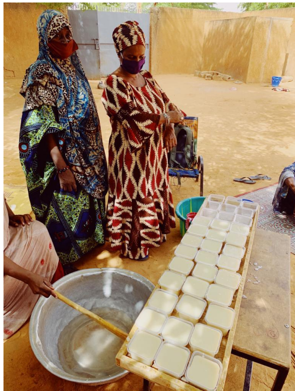
Soap production by refugee in Niger as part of UNHCR's COVID response.