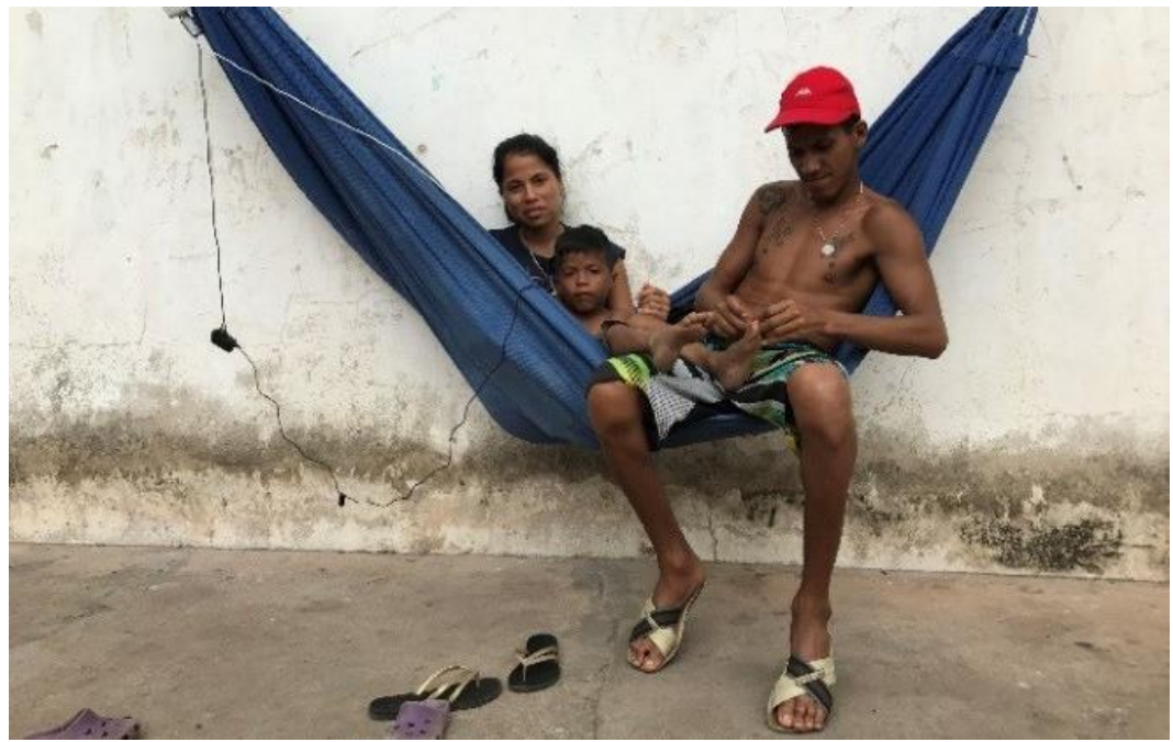
After arriving in Boa Vista, Brazil, with only the things they could carry, this young family found refuge in the Tancredo Neves shelter. As there is no more space inside the shelter, they sleep together in a hammock they brought with them. Some 400 Venezuelans are currently living in the shelter set up in Boa Vista, even though the maximum capacity is for some 300 people.

UNHCR is working with Governments to address the protection and essential needs of Venezuelans in host countries and continues to call for protection-oriented responses, such as humanitarian visas, special stay arrangements or other regional migratory frameworks, with the relevant protection safeguards. UNHCR has developed a regional response plan that covers eight countries and the Caribbean sub-region.