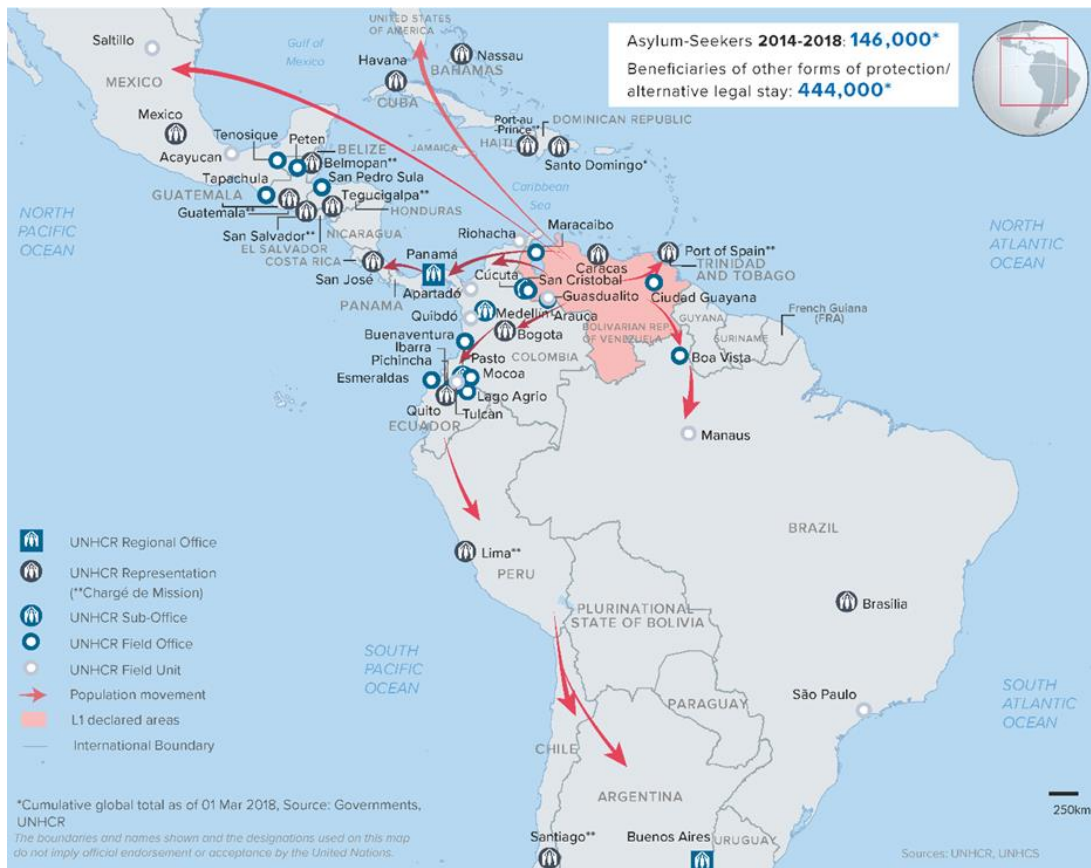
Asylum applications 2014-17 in primary countries of asylum

Colombia, Brazil and Guyana announced new measures to address the arrivals of Venezuelans, as border areas are increasingly overstretched.