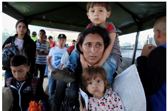
Cúcuta, Colombia. A mother with her two sons crosses on foot the Simon Bolivar International Bridge into Colombia.

While some Venezuelans have obtained documentation which allows them to stay legally, the majority have no regular status, and are therefore more vulnerable to exploitation, abuse, violence, trafficking and discrimination.