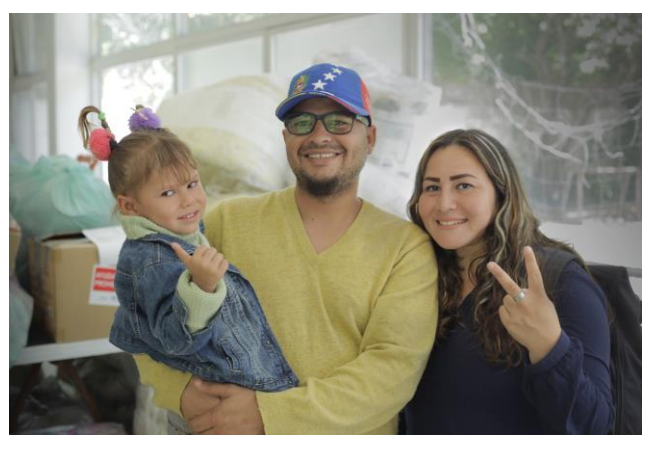
Venezuelan family receiving winter items in Montevideo