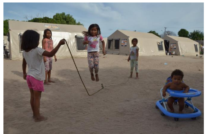
Children play at the shelter in Boa Vista, Brazil, where new tents have been set up with the support of UNHCR.