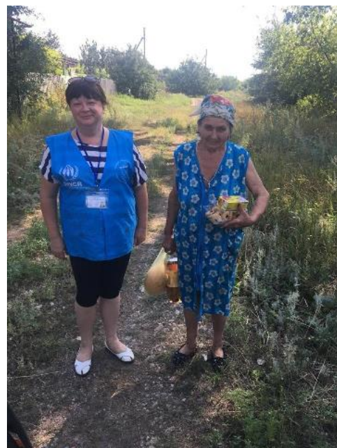
UNHCR through its Partner Proliska is the only organisation that has access to the village of Spirne, situated some 30 km from the Contact Line. Only elderly people stayed in the settlement, deprived of all services, namely food, medicine, transportation, gas and central heating. UNHCR is providing them with essential humanitarian and protection aid.