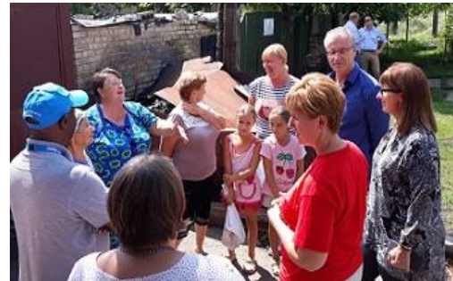
UNHCR took Minister to the village of Kurdiuivka. In this village, UNHCR and implementing partners rehabilitated 38 homes. Despite absence of military in the city, it suffered various shelling incidents in early 2015, early 2017 and recently in early 2018. As a result, people were killed and buildings destroyed. In response, UNHCR not only repaired 38 homes but also coordinated other partners through its Shelter Cluster to repair and provided in-kind material donations to a total of 83 households. Before, the village survived thanks to a ceramic factory. However, the factory was destroyed early in the conflict leaving the residents with no livelihood.