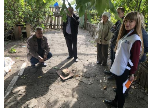
Photo on the right shows the location where a shell landed in the yard of an elderly woman in Sakhanka. Part of the projective is covered by bricks and still represents a threat for the elderly woman who lives there.

Reaching isolated settlements for the first time: UNHCR joined forces with its NGO partners - Proliska , Right to Protection (R2P) , Slavic Heart , the Norwegian Refugee Council (NRC) , MOST and the Donbas Development Center (DDC) – to reach out to previously inaccessible settlements along the 'contact line', including Pervomaiske in Luhansk oblast and Sakhanka in Donetsk oblast, where 220 households and seven families (respectively) received core relief items such as blankets, kitchen sets, buckets and jerry cans in order to address their most pressing needs after recent shelling. Approximately 450 people currently live in Sakhanka where mostly elderly people reside and require humanitarian assistance.